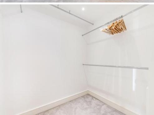
Main Road, DA14 Approximate Gross Internal Area = 46 sq m / 496 sq ft